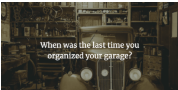
October 14, 2016 The season has shifted and we are "officially" in fall. When I think about the...