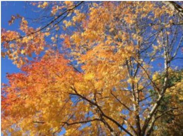
New Year's Day 2015 December 28, 2016 January 1st marks a time for us to reflect on what we did or ...